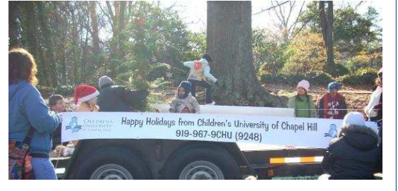
Attaching our beautiful banner!